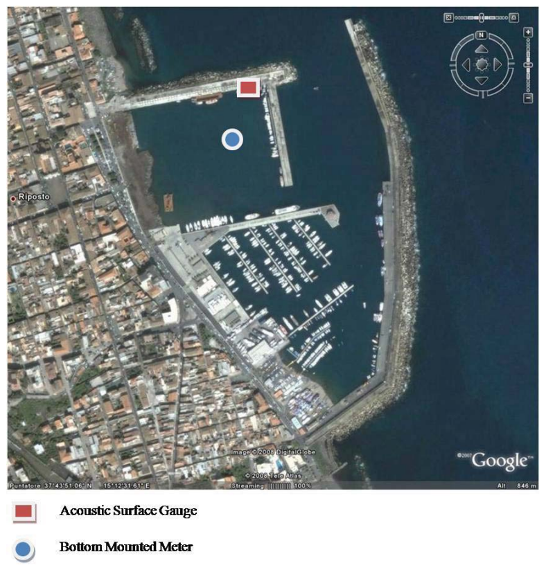
Figure 1. Riposto marina, with wave gauge positions.

Both instruments had independent data logging capabilities and one of them (DCU 1103) also had a real time data connection through a GSM mode. Standard algorithms (Zero Crossing, FFT) were performed to extract wave parameters of interest. More than six months of data were collected, with some interruptions during long power breaks caused by very heavy storms.